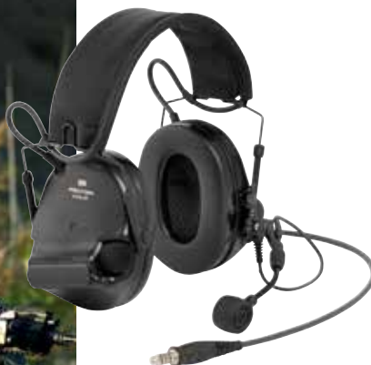
Special Response Headset